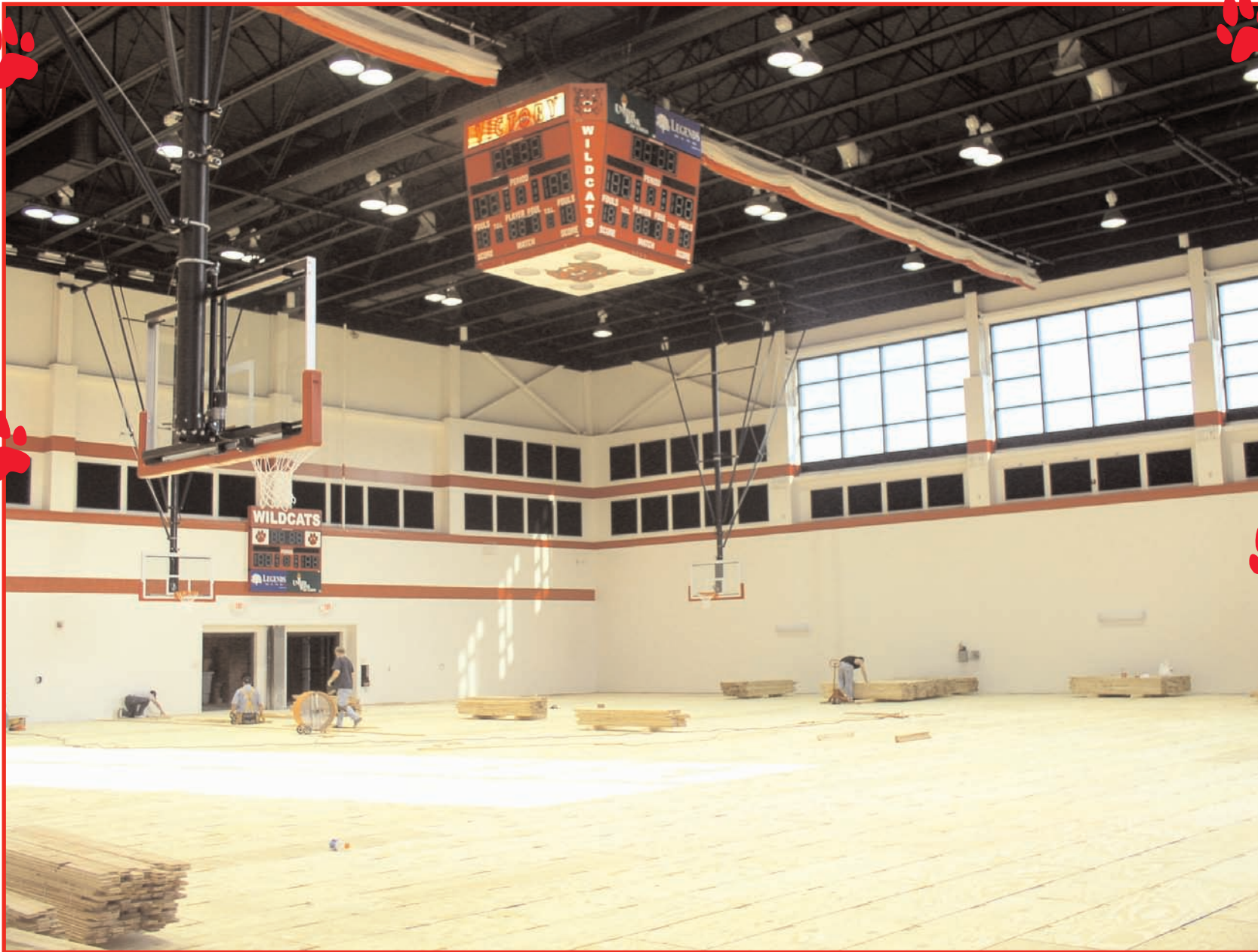
The New UHS Gym