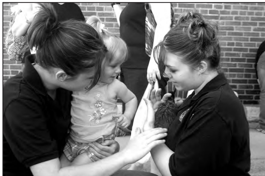
A popular event at the Union Founders' Day was the petting zoo sponsored by the Union FFA.