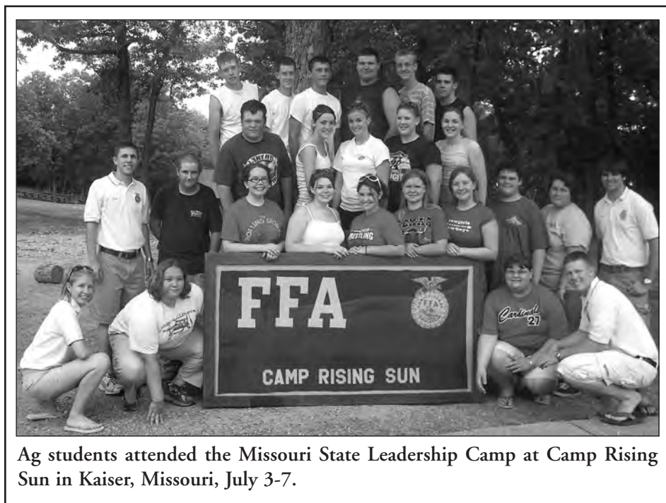
Ag students attended the Missouri State Leadership Camp at Camp Rising Sun in Kaiser, Missouri, July 3-7.